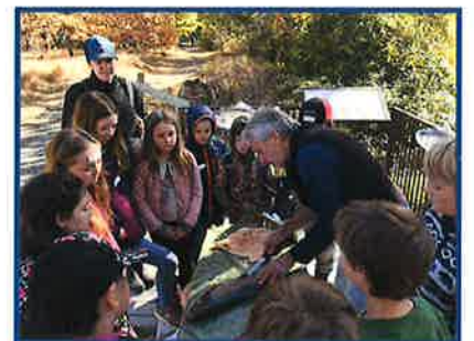
Dissection of hatchery fish

North Medford High School Science Teacher