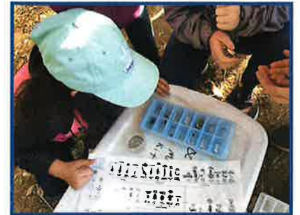
Identifying stream macroinvertebrates

# of individual instructors contributing: 32