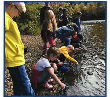
Measuring water temperature

... Salmon Watch was a great experience for the students. Even the most advanced kids in the group got a lot out of the day and learned some crucial things ... that they simply wouldn't have learned without that outdoor hands-on experience. Some of my most challenging environmental (science) kids picked up so much that day that I've actually been able to use their new knowledge ... ever since then.