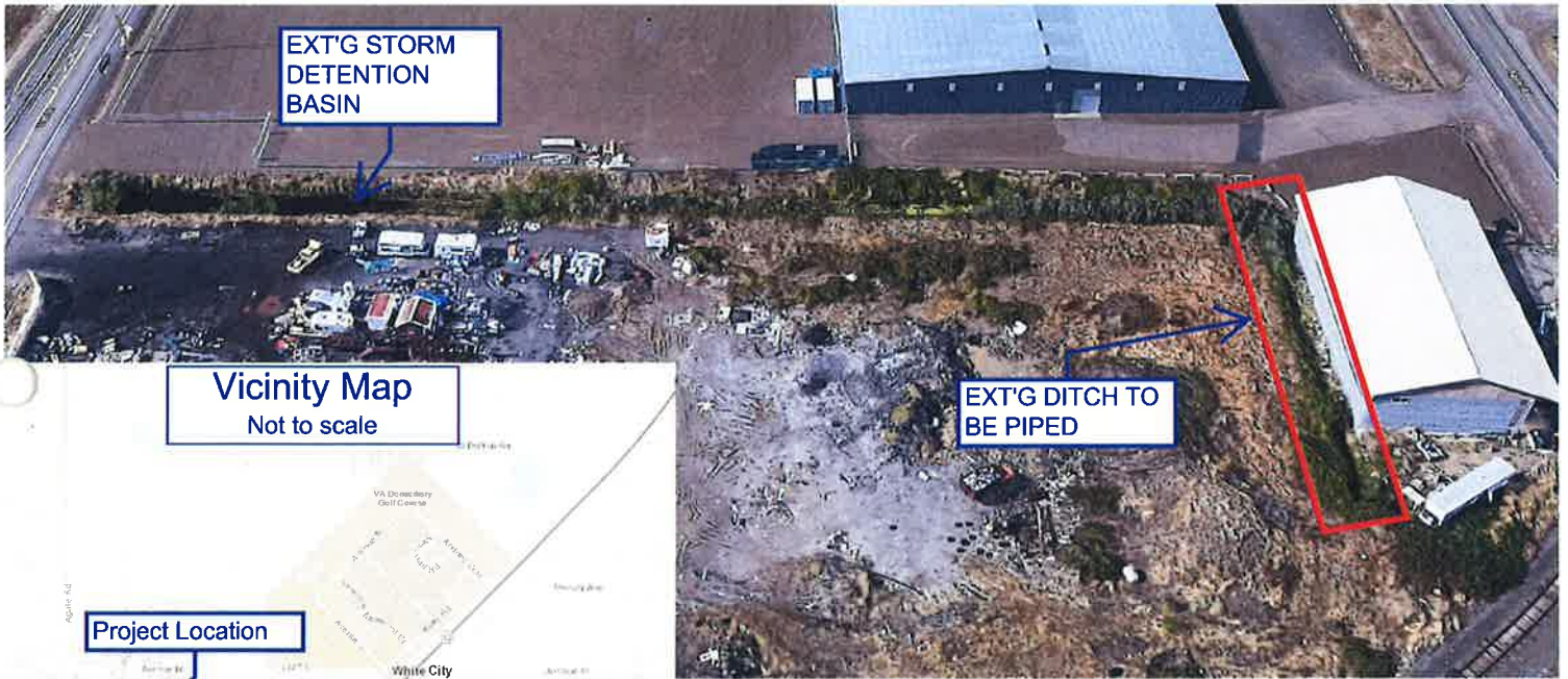
Vicinity Map Not to scale