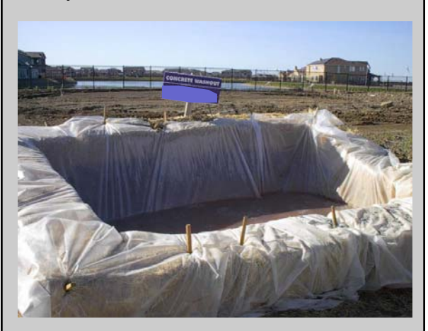
An example of a properly designed concrete washout. Washouts can be scaled down for use on smaller projects.